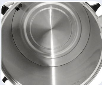
Stainless Steel Interior