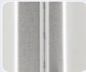
Water Gauge Indicator