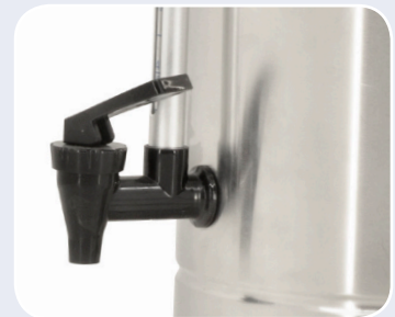
Non-Drip Water Faucet